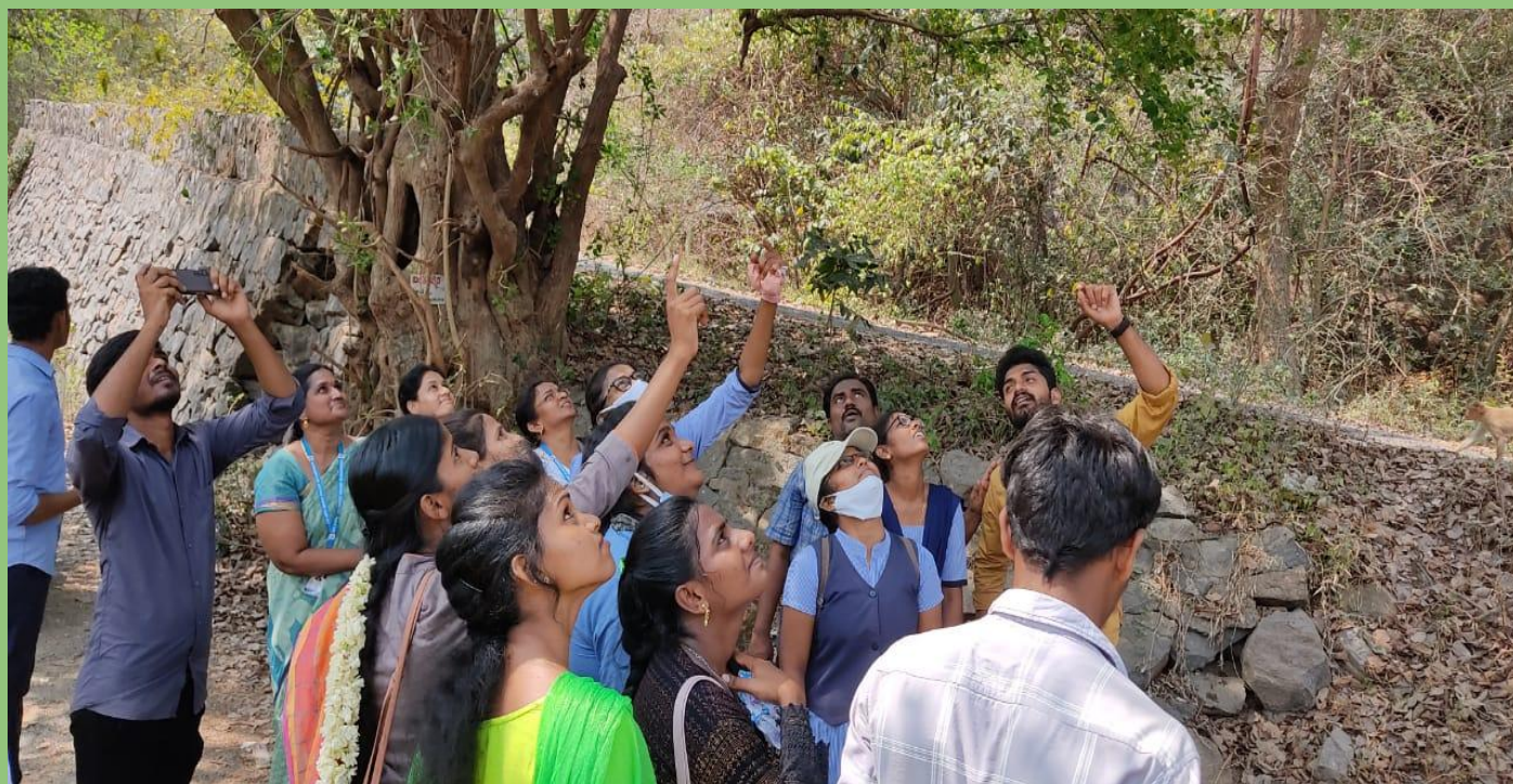
Students and Faculty studying the Plant species of Ecological Significance in Forest area

Students Photographed the plants of significant Ecological and Taxonomic significance and collected some parts of the plants .