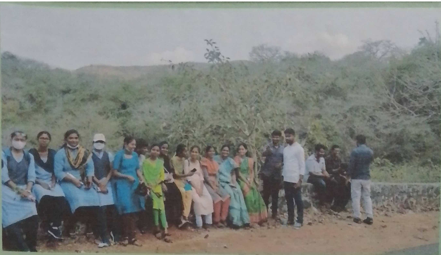
The tour was very informative and beneficial to Botany students .